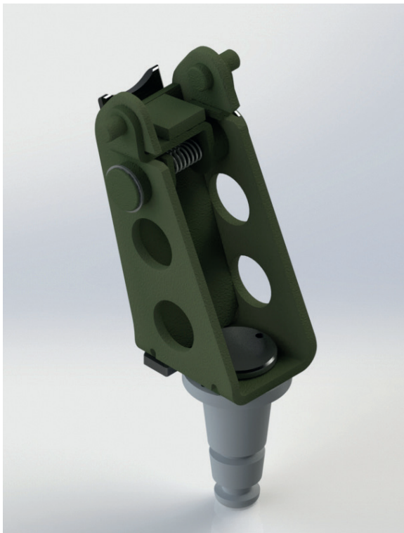
WITH FN / MAG (7,62MM)